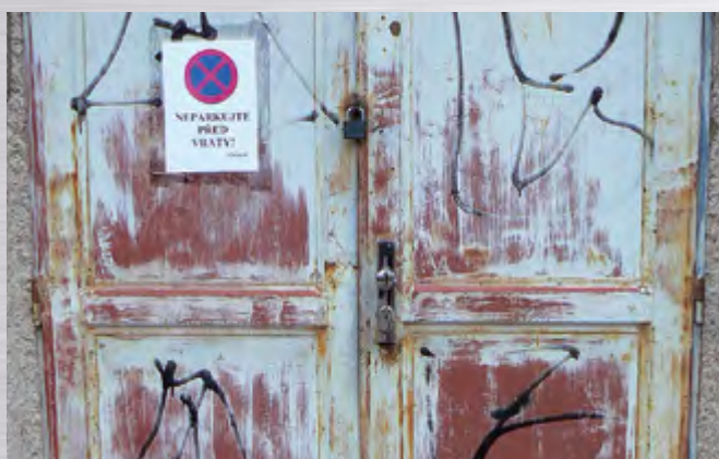
State before assembly

An important novelty between security products is the stainless steel fitting. It forms, together with a TOKOZ cylinder, a highly resistant set suitable to extreme environments of industrial buildings, companies or, for example, remote locations where high security is needed.